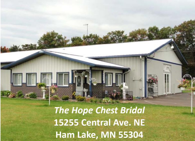
The Hope Chest Bridal 15255 Central Ave. NE Ham Lake, MN 55304